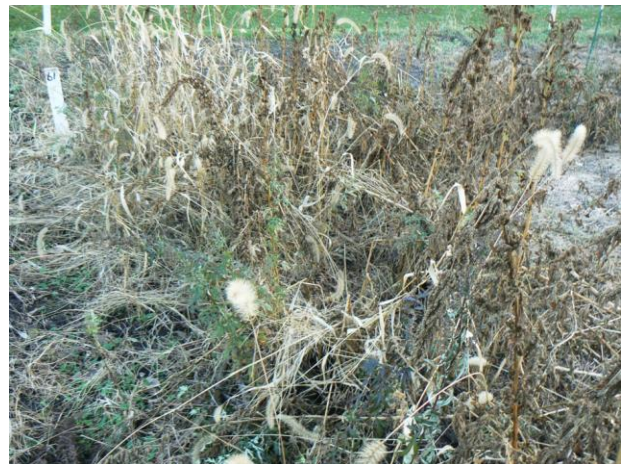
Large Plant Material Present