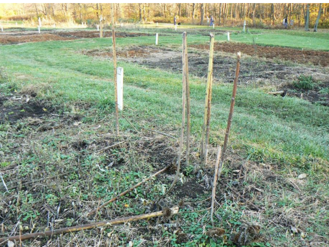
Non-Plant Material Present